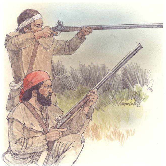
The painting, The Constant Search for Food , by Roger Cooke shows two corpsmen hunting. Washington State Historical Society Collection.

When we awoke this morning to our great Surprize we were covered with Snow, which had fallen about 2 Inches the latter part of last night, & [it] continues a verry cold Snow Storm. Capt. Clark Shot at a deer but did not kill it. We mended up our mockasons. Some of the men without Socks, wrapped rags on their feet, and loaded up our horses and Set out without anything to eat, and proceeded on. Could hardly See the old trail for the Snow.