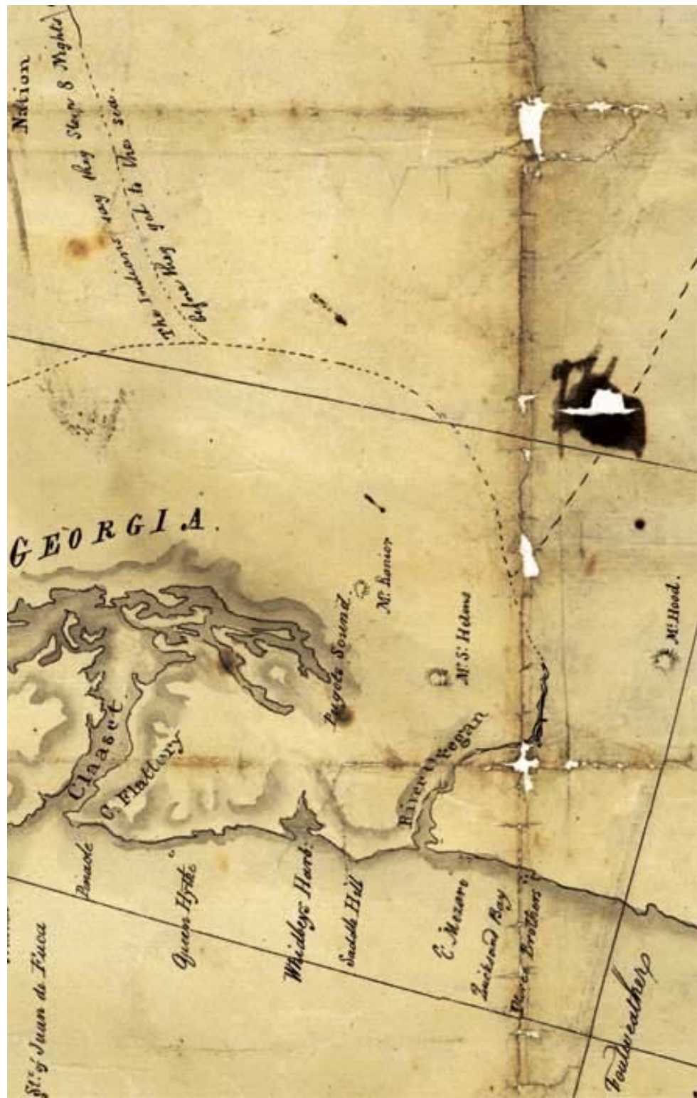
Portion of 1803 map of northwestern territories, untitled, by Nicholas King. Library of Congress Geography and Map Division, Washington, D.C.