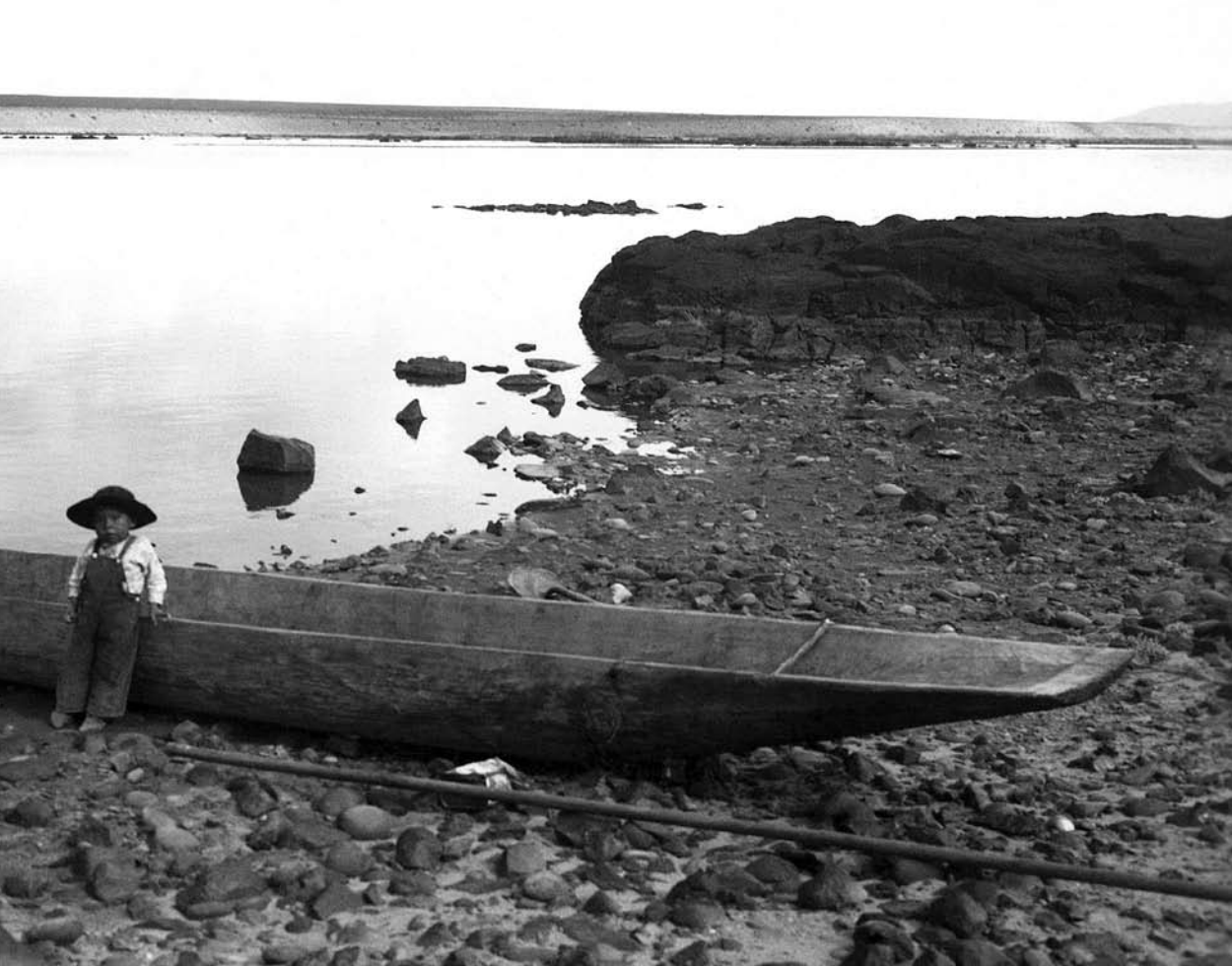
Wanapum canoe near Priest Rapids, 1951 (Wanapum boy is Willy Buck). The mid-Columbia Indian dugout canoes lacked the elegant bow and stern features of the lower Columbia canoes and resembled the expedition's Clearwater canoes.