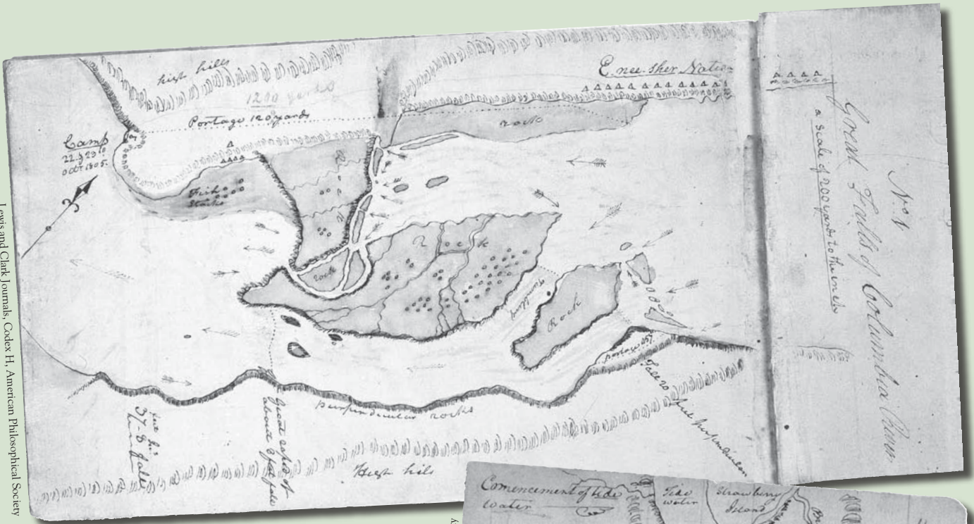
ABOVE: The Great Falls of the Columbia, later called Celilo Falls, drawn by Clark October 1805. The baggage portage is shown by the dotted line on the left and the canoe portage in the upper right hand corner.