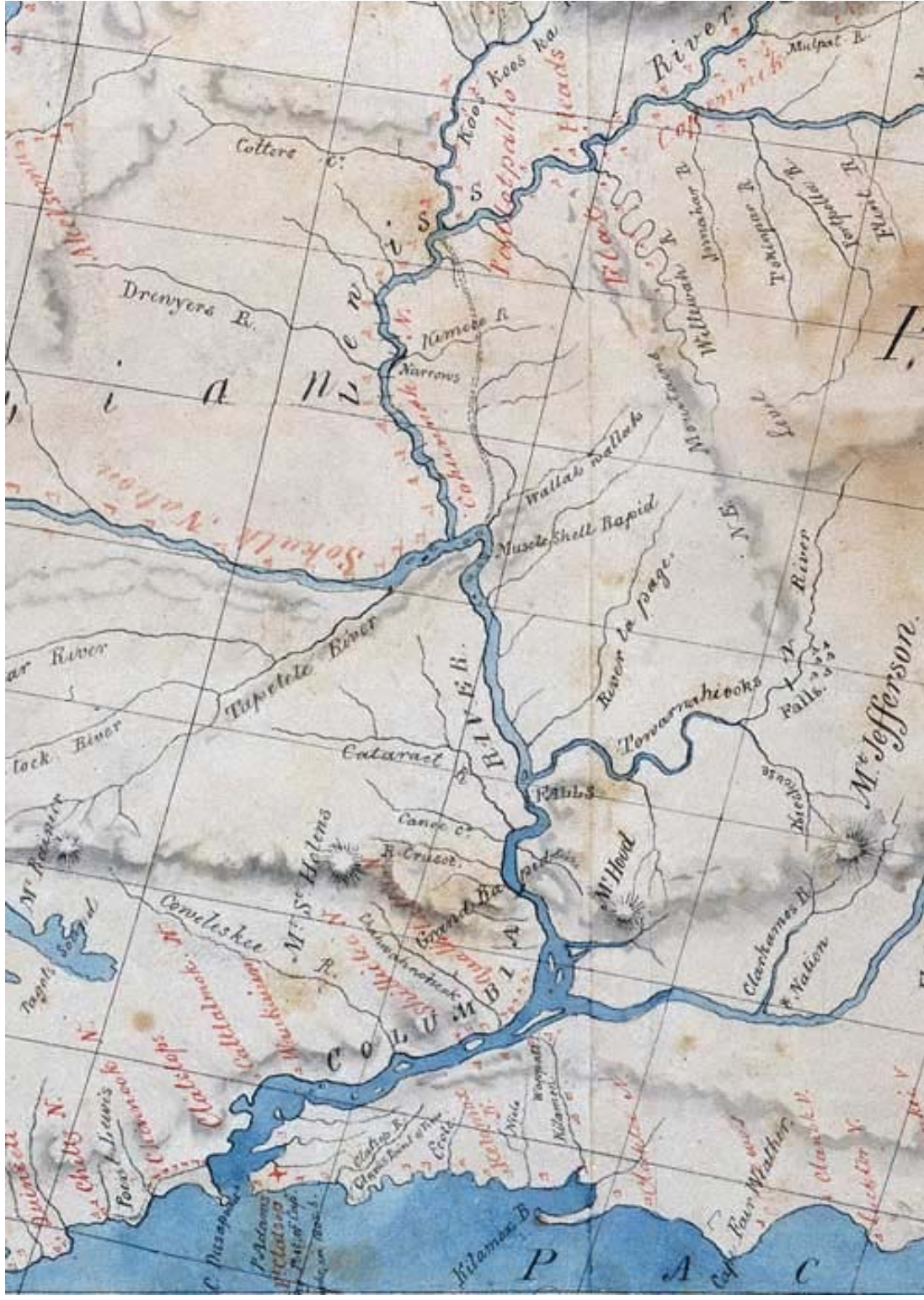
Portion of the 1806 map by Meriwether Lewis and William Clark, titled "Map of part of the continent of North America: whereon is laid down the Missouri... and the Columbia Rivers, from the Mississippi to the Pacific Ocean."