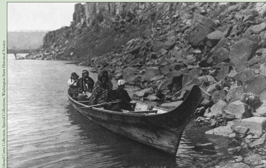
Edward Curtis photo, taken at the Long Narrows c. 1910, of a Wishram canoe that resembles the canoe Lewis acquired below Celilo Falls. As the stern cannot be seen, it could be either a Cutwater or Chinook form.

Despite extremely rough water, rapids, falls, rocks on the rivers, severe winter storms in the Columbia River estuary, and numerous repairs, all of these ponderosa pine dugout canoes served the expedition well with no catastrophic failures. They were abandoned only when much lighter, more agile, Indian canoes