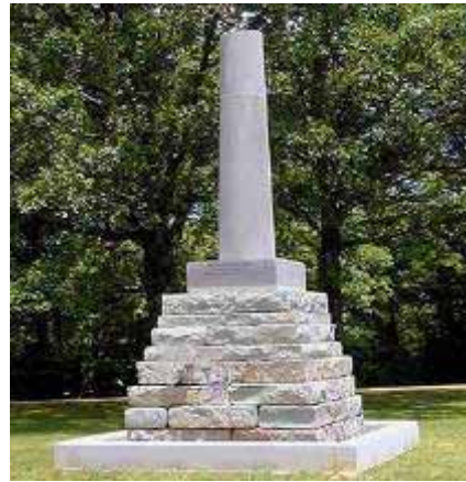
This monument was erected in honor of Meriwether Lewis on the Natchez Trace Parkway.