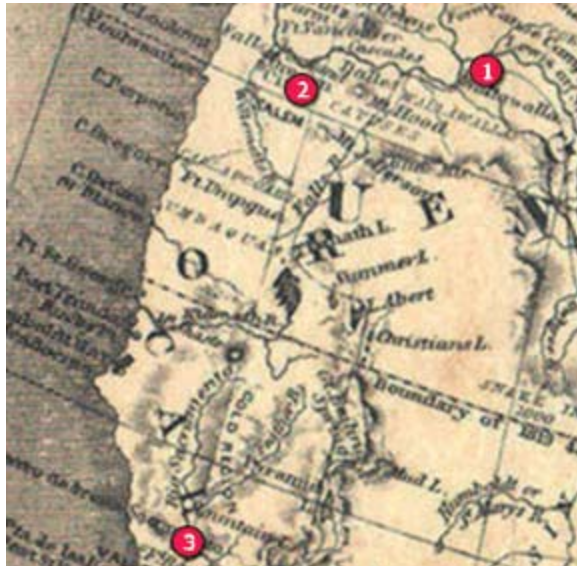
This map shows three places important in the life of PeoPeoMoxMox- Walla Walla (1), the Willamette Valley (2) and Sacramento (3).