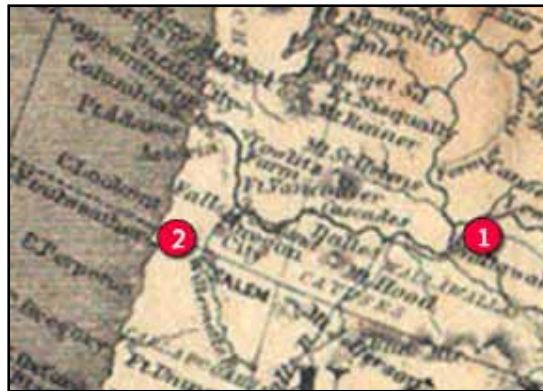
The map above shows the locations of both Walla Walla (1) and the Grande Ronde Valley (2).