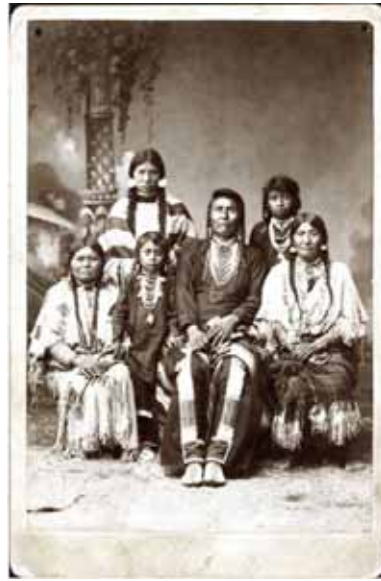
This portrait features young Joseph, the old chief's son, and his family ca. 1877. After their surrender at the end of the Nez Perce war, the family was taken to Kansas. Despite promises made to return them to the Pacific Northwest, they would not return to their homelands until 1885.

more restricted reservation. The Indians' response was the Nez Perce War.