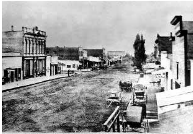
MAIN STREET, WALLA WALLA, IN 1877.

few months. From what source they obtain it is impossible to tell...many of the Cayuses and Walla Wallas living in the valley have been leading a most dissolute and renegade life lately, under no control whatever.