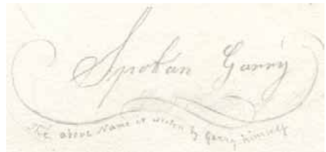
A detail of the signature of Spokan Garry.

Garry himself accompanied us to the forks of the Spokane, where his band usually reside. A few lodges, chiefly old men and women, were there at the time. His own, in neatness and comfort, was far beyond any we had seen. His family were dressed in the costume of the whites, which in fact now prevails over their own. Many of the Spokanes, besides their intercourse with the fort, visit the American settlements, where they earn money by occasional work, most of which is spent in clothing, blankets, &c. The chief offered us the hospitality of his house with much cordiality - a cup of tea or coffee and bread.