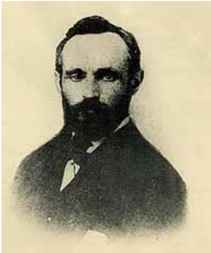
Photograph of artist Gustav Sohon. As an artist, Sohon was a product of his time and his depictions of treaty events reflect this. His drawings and watercolor paintings allow everyone who views them to see, through his eyes, the treaty councils between the United States Government and Indian tribes of the Pacific Northwest.