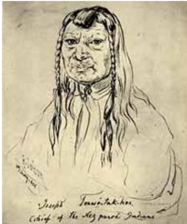
This portrait of Joseph was painted by Gustav Sohon on May 29, 1855.