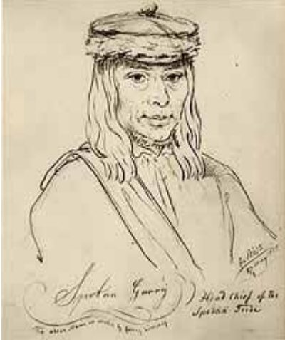
Sketch of Spokan Garry of the Spokane Indian tribe by artist Gustav Sohon done on May 27, 1855. The signature on the illustration is by Garry himself.