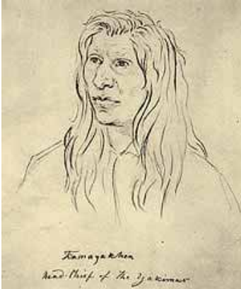
This portrait of Kamiakin was created by Gustav Sohon.

Kamiakin lived in what is present-day central Washington as a child, but his family traveled to the Great