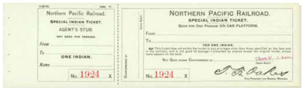
The image above shows an "Indian ticket" from the Northern Pacific Railroad issued in 1886. Such tickets were issued to Native Americans traveling by train.