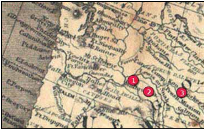
The map above shows three areas involved in the Walla Walla Treaties: Walla Walla (1), the Wallowa Valley (2) and the Lapwai Valley (3).

By 1877, the federal government had tried to force the "non-treaty" bands, including the Wallowa Nez Perce, now led by young Chief Joseph, out of their homelands and onto the