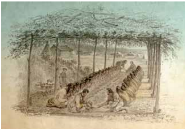
The painting "Chiefs at Dinner, Walla Walla Council, 1855" shows Gustav Sohon's rendition of a banquet for the native leaders attended by both Palmer and Stevens. He shows both men serving the other leaders on tin plates. Although the chiefs were given provisions each day, this was the only such occasion on which the commissioners were present.

In 1853, Palmer was appointed Superintendent of Indian affairs for the Oregon Territory. Serving with distinction, Palmer had the difficult task of securing Oregon lands from warring Indian tribes while preventing the outbreak of hostilities. During his tenure, he negotiated numerous treaties.