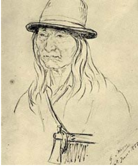
PeoPeoMoxMox was the head chief of the Walla Wallas. This drawing of him by Gustav Sohon was painted on June 7, 1855. Courtesy Washington State Historical Society.

PeoPeoMoxMox was an important chief of the Walla Wallas at a critical period in Northwest history.