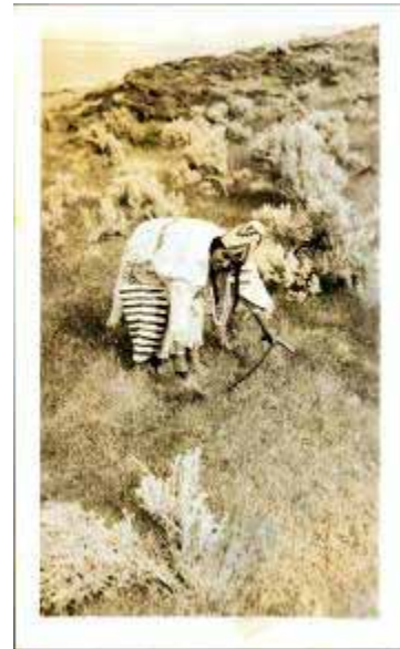
This photographer asked Yakama women to dress in traditional clothes and demonstrate gathering activities. The picture above is entitled "The Plateau Gatherer".

In the early 1700's they acquired horses and became highly skilled horsemen. The horse made possible expeditions to the plains east of the Rockies to hunt the plentiful buffalo, a journey of many months.