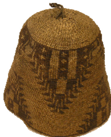
This woman's basketry hat is woven in wrapped twining of hemp, bear grass, and an unidentified plant fiber. The creator was most likely a member of a plateau tribe.

All of the land where we live and where our ancestors lived was created for the (Indian) people.*