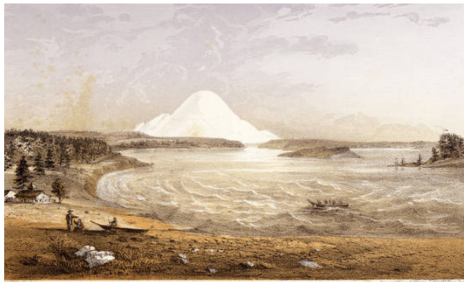
This painting, Puget Sound and Mt. Rainier from Whitby's Island by John Mix Stanley, shows Mt. Rainier which, like Mt. Adams, was considered in Yakama belief to have been one of the wives of the sun.

Jealous and angry, she fought them and broke down their high heads. All that is left of Plash-Plash is Goat Rocks. All that is left of Wahkshum is the mountain called Simcoe Mountain and the little huckleberry bushes on it. Rainier and St. Helens were so far away that Pahto left them alone.