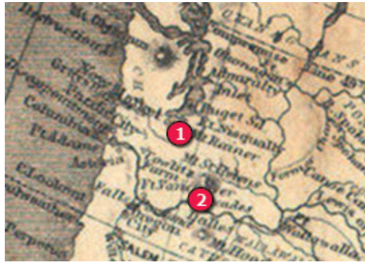
This detail of an 1857 map shows the approximate location of Mt. Rainier (1) and Mt. Adams (2), two of the mountains described in this legend.

But after Pahto lost her head she became mean. When she was angry, she would send a big thunder-storm and much rain. In the winter she would send big snows and in the spring there would be floods. All thru the Valley there were lakes from the