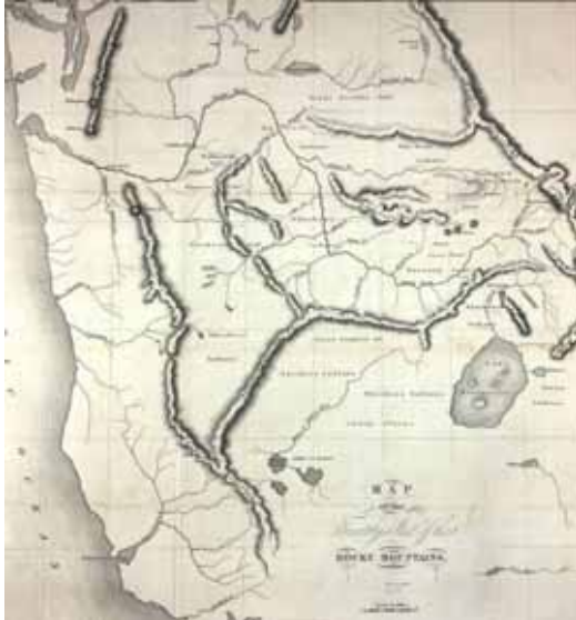
The above "Map of the Territory West of the Rocky Mountains" was drawn in 1837 by B.S.E. Bonneville and lists all of the Native American tribes known to him at that time.