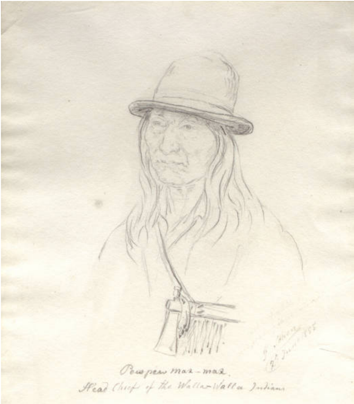
This portrait of Peo Peo Mox Mox was created on June 7, 1855 by Gustav Sohon. The clothing, as depicted by the artist, shows adaptation to Euro-American fashions. Around his neck, he wears a tomahawk pipe.