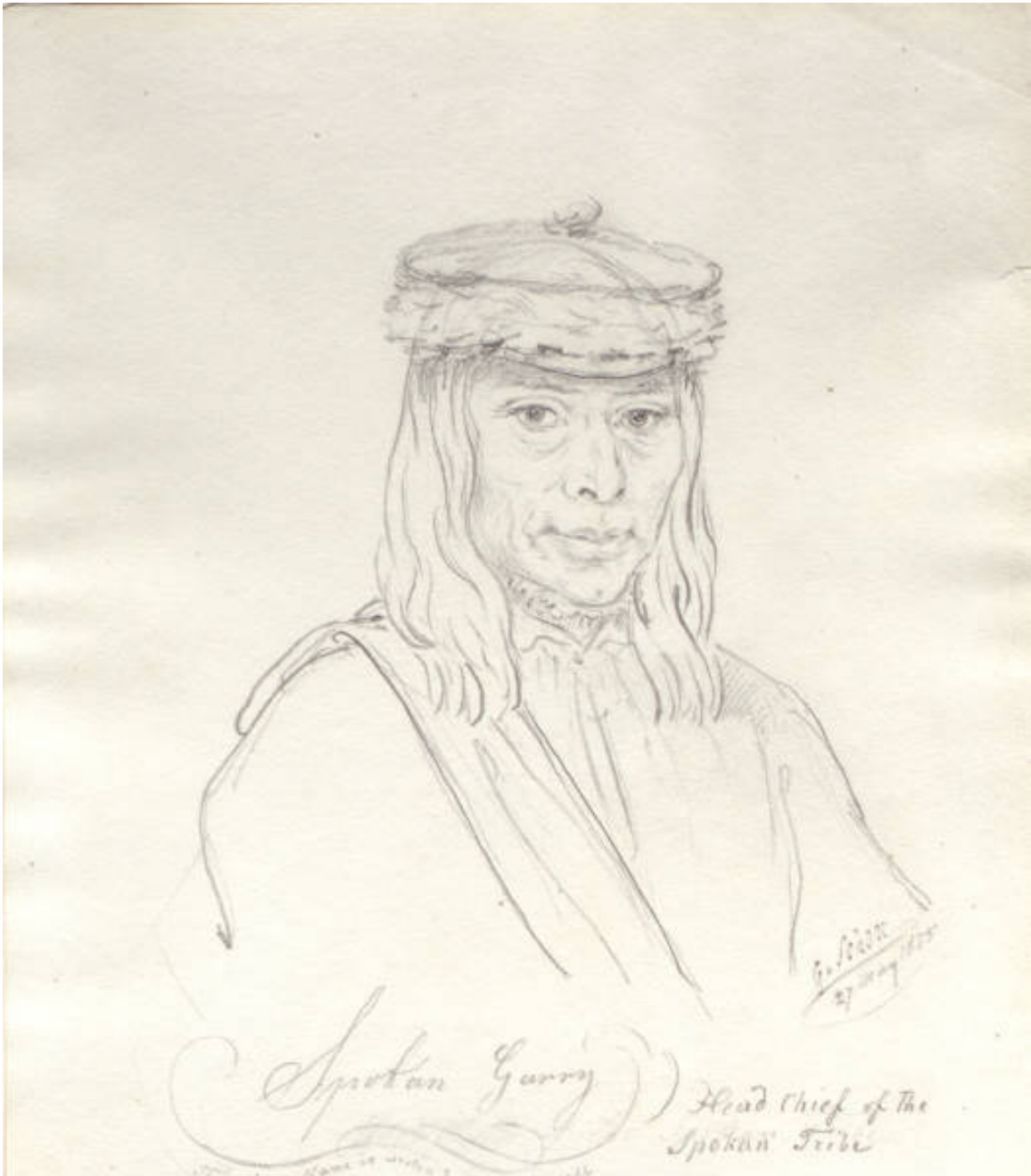
Spokan Garry was sketched on May 27, 1855 by Gustav Sohon. Although the notations on the image were written by Sohon, the signature is Garry's own.