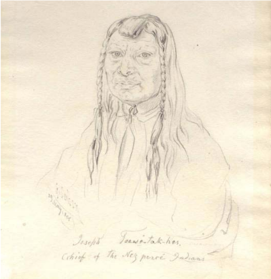
This image of Toowe-tak-hes (also known as Chief Joseph) was created by Gustav Sohon on May 29, 1855.